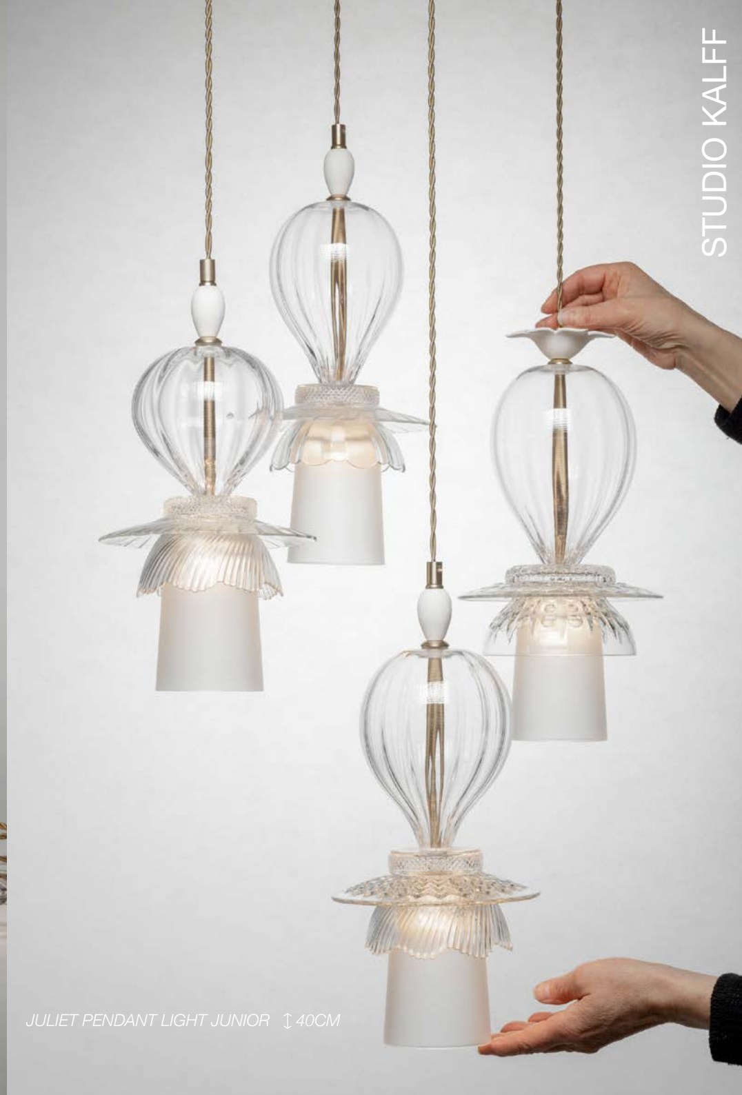
JULIET PENDANT LIGHT JUNIOR \updownarrow 40CM