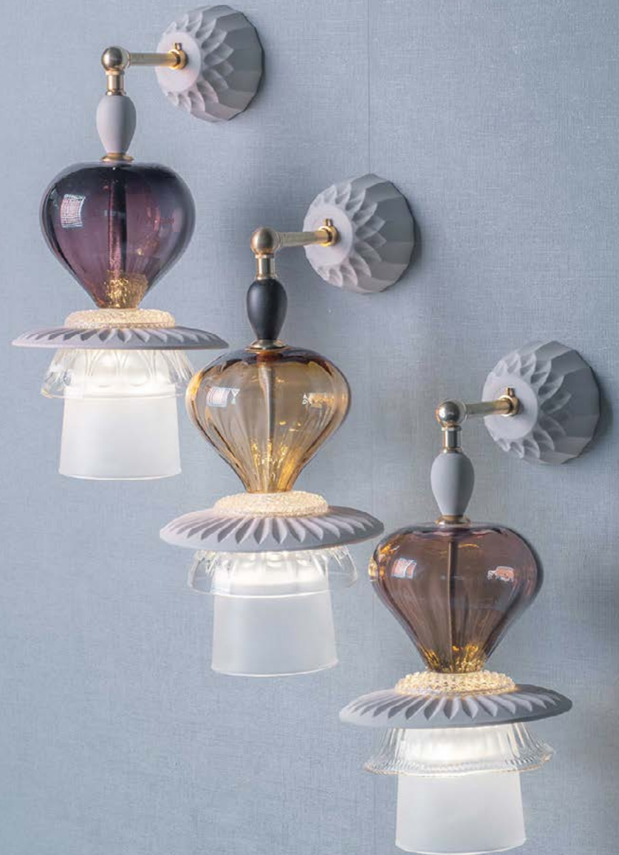
JULIET PENDANT WALL LIGHT SMALL ↑ 30 CM