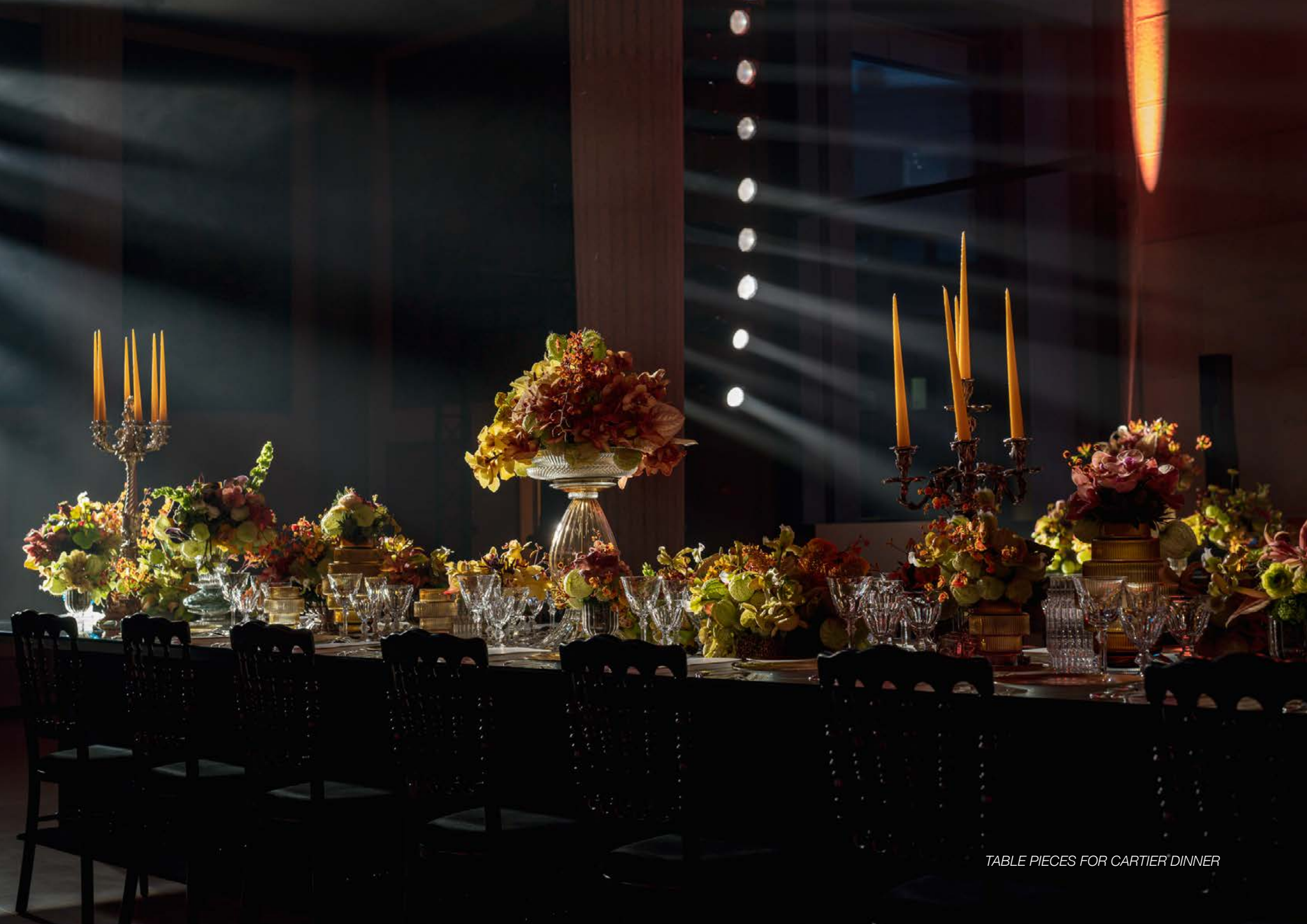
TABLE PIECES FOR CARTIER DINNER