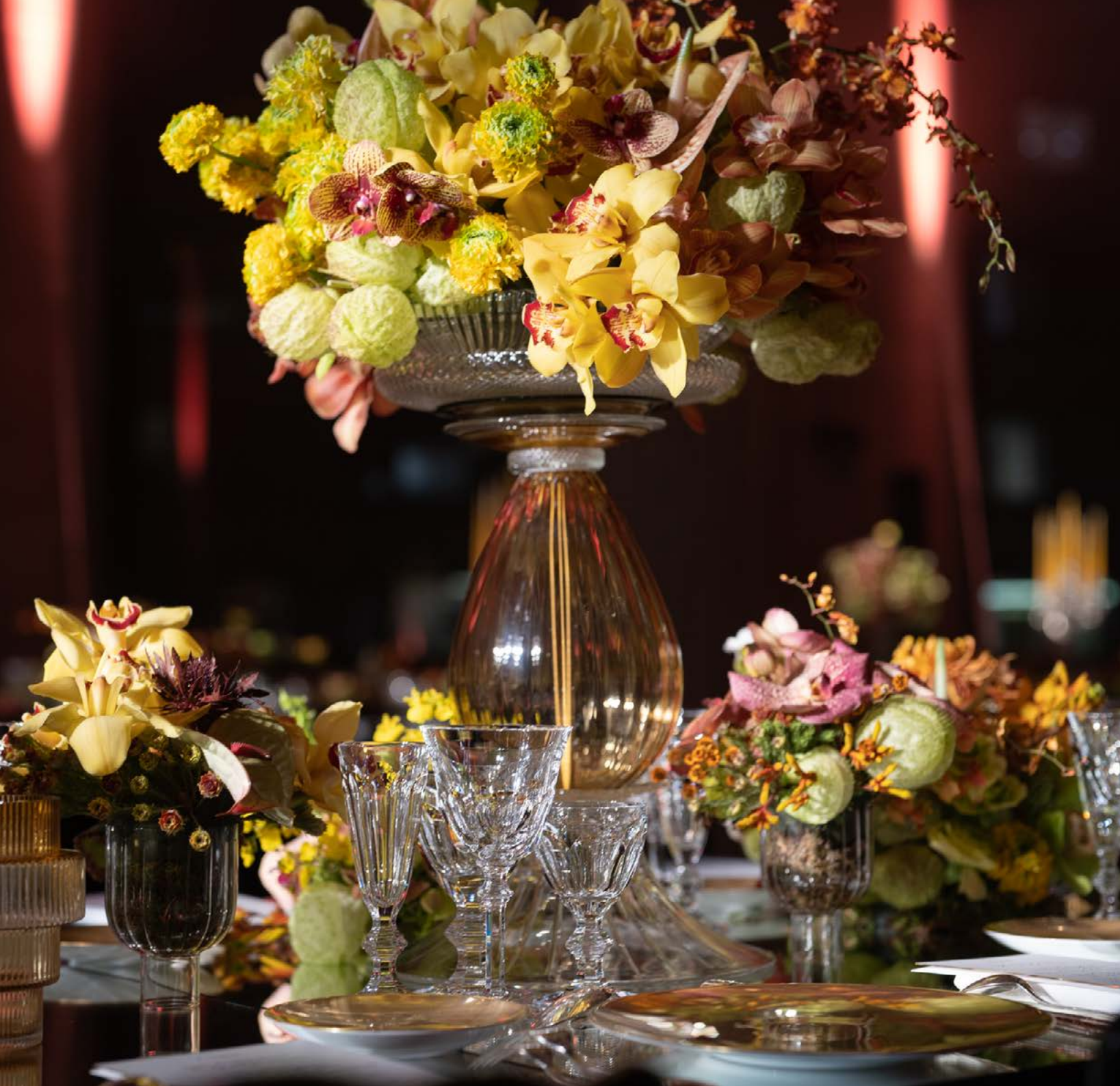
TABLE PIECE FOR CARTIER DINNER