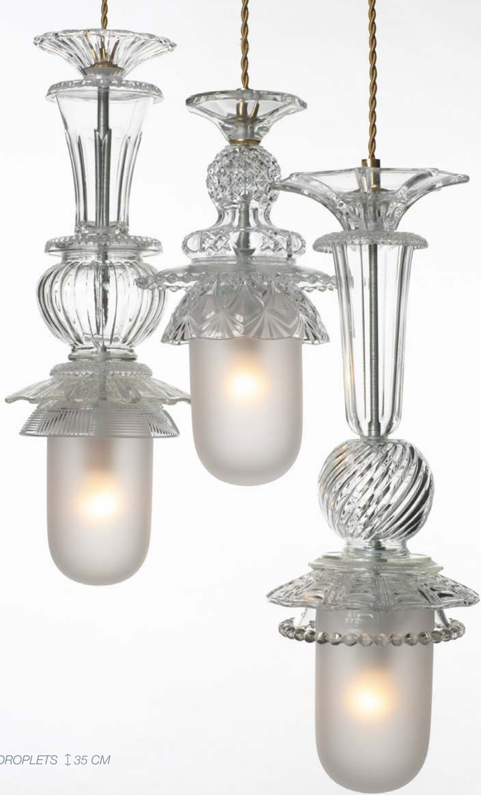
DROPLETS ↓ 35 CM