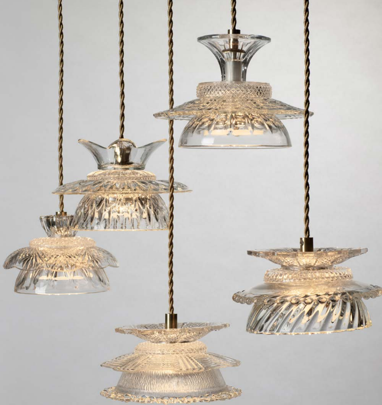
FIREFLY ↔ 15 CM ↓ 10 CM