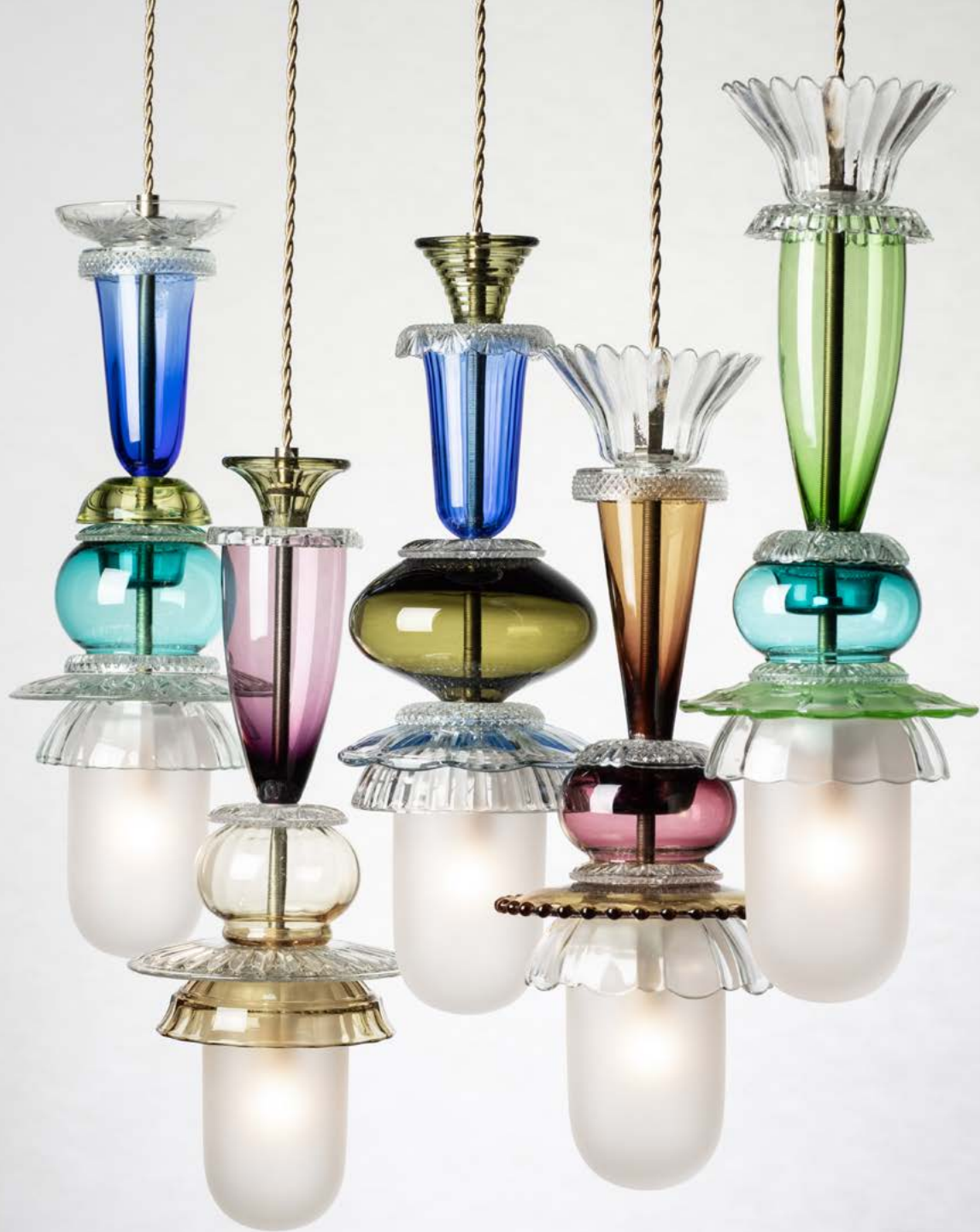
DROPLETS ↓ 35 CM