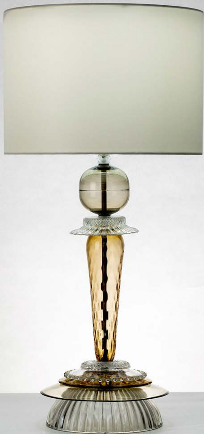
TABLE LAMP ↓ 70 CM