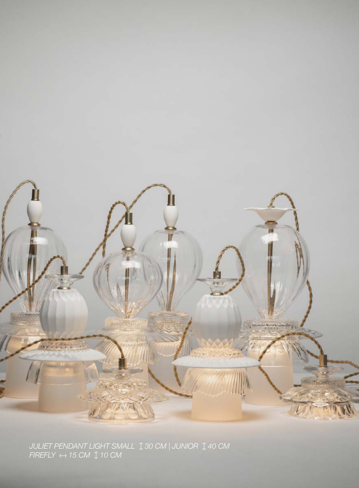
JULIET PENDANT LIGHT SMALL \updownarrow 30 CM | JUNIOR \updownarrow 40 CM FIREFLY \leftrightarrow 15 CM \updownarrow 10 CM