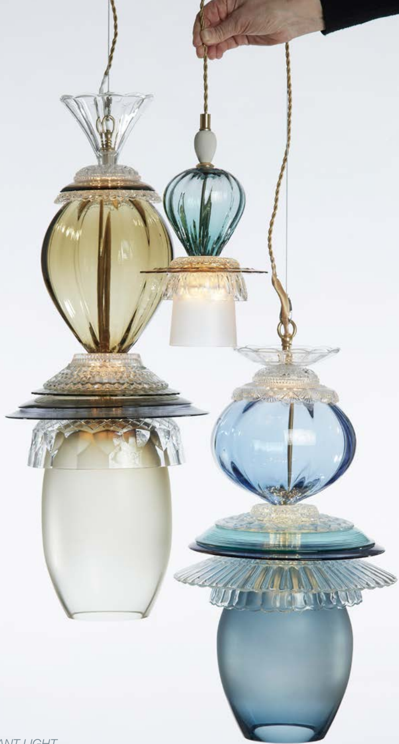
JULIET PENDANT LIGHT SMALL ↓ 30CM | MEDIUM ↓ 65CM | LARGE ↓ 80CM