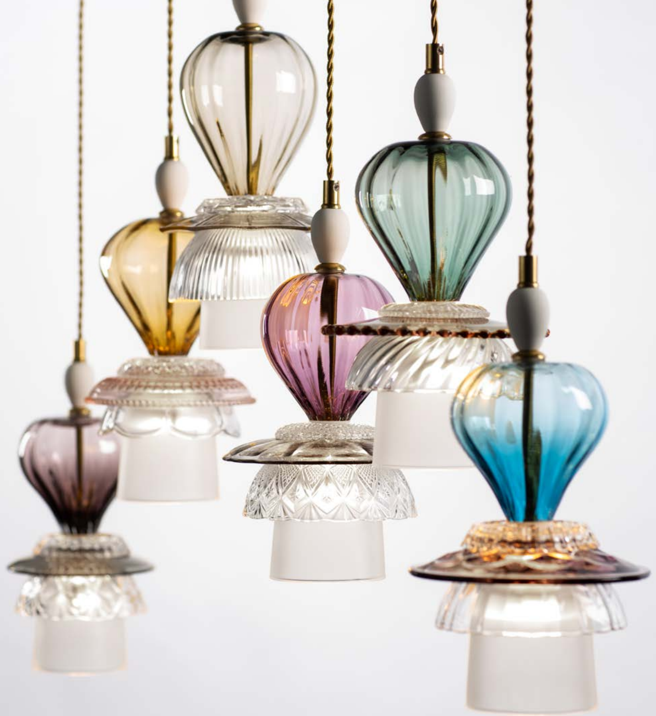
JULIET PENDANT LIGHT SMALL ↓ 30 CM